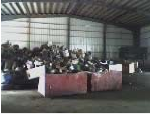
Xiong's Scrap yard (inside)