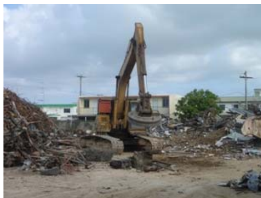
Heavy Equipment sorting metals at Scrap yard