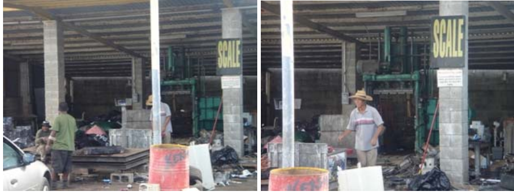
Scale at Pyramid Recycling