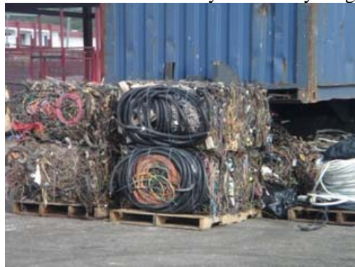
Baled wires ready for shipping