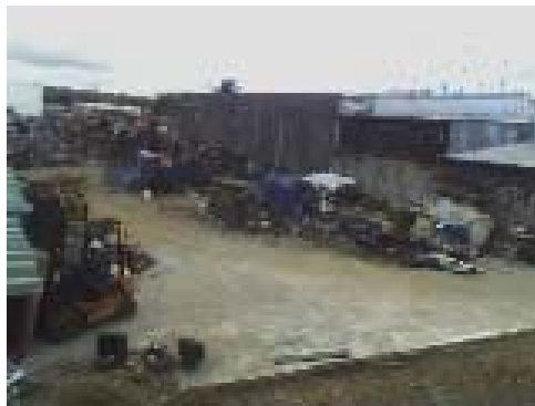
Xiongs Scrap yard (back)