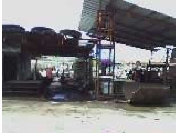
Triple Star Recycling Facility

Containers filled with scrap metals are usually shipped off two (2) to four (4) times a week.