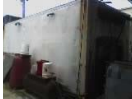
Processing occurs in a 20 ft. container located at their office.