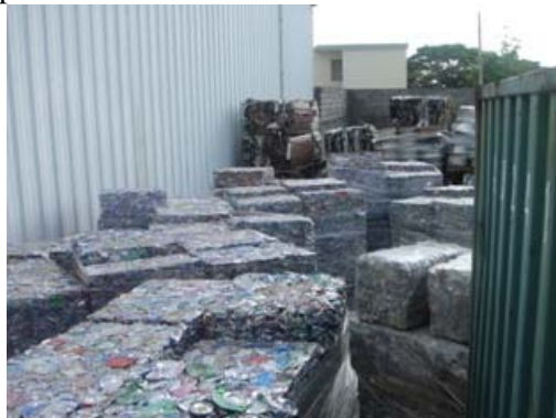
Baled and Shrink wrapped aluminum cans ready for shipping.