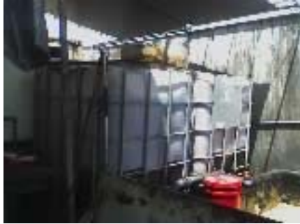
Used cooking oil is stored for sediments to settle.