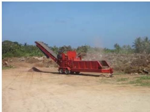
Horizontal Grinder used at the Northern hardfill to grind wood waste and turn it into mulch.