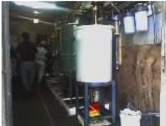
Processing of waste cooking oil to biodiesel.