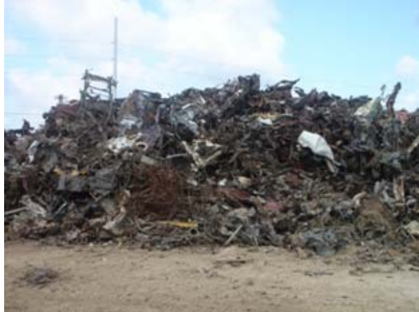
Scrap Metal Inventory