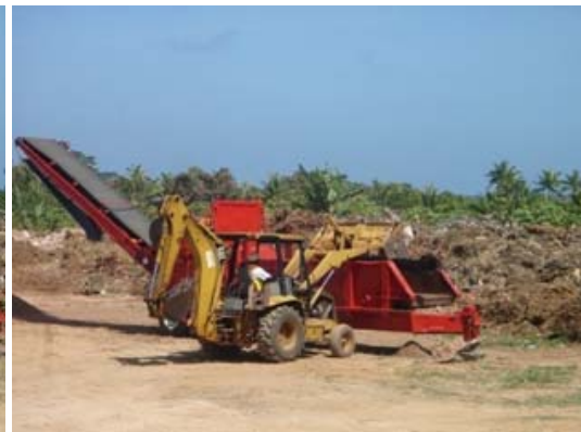
Horizontal grinder while in operations (tree trunk being fed to the machine for grinding)