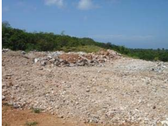
Construction and Demolition Site (Northern Hardfill)